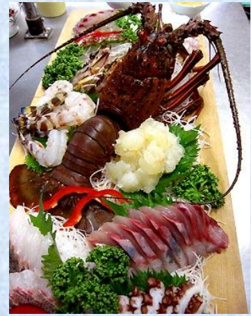
Reihoku Town Spa has a commanding view of Tomioka Bay, while no effort is spared in the preparation of Reihoku cuisine.