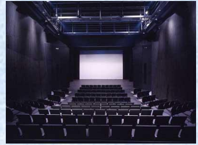
Reihoku Conference Hall